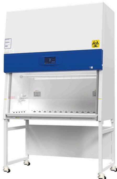
CLASS II, TYPE A2 BIOSAFETY (NSF 49)